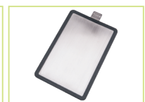
Metal Patient Plate

The catalogue is for reference only and subjects to changes without notice.