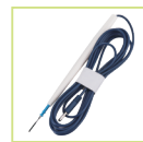
Foot Switch Electrosurgical Pencil