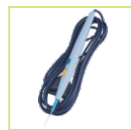
Push Button Electrosurgical Pencil