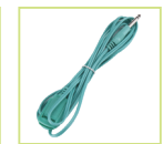
Patient Plate Cable