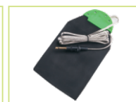
Silicon Patient Plate