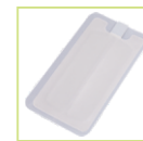
Disposable Bipolar Neutral Pad